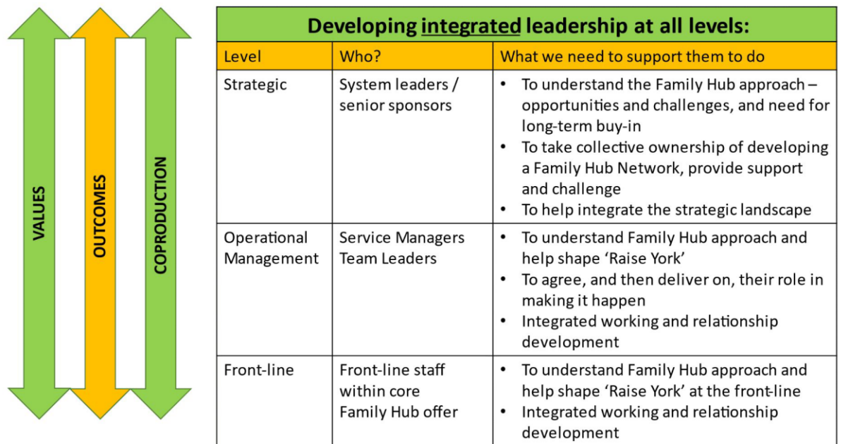
diagram below shows how this work will drive understanding and ownership of Raise York throughout the city.

ii. Supporting Families Advisors - We recognise the important role partners play in delivering early help. Partners have also fed back they want more support in delivering early help and leading Early Help Assessments. We have remodelled our Supporting Families team to better support partners. Supporting Families Advisors can provide practical advice and support to agencies across York undertaking early help. This includes training on use of early help tools, navigating what services are available and holding support surgeries in the city to bring together key agencies and drive working together.